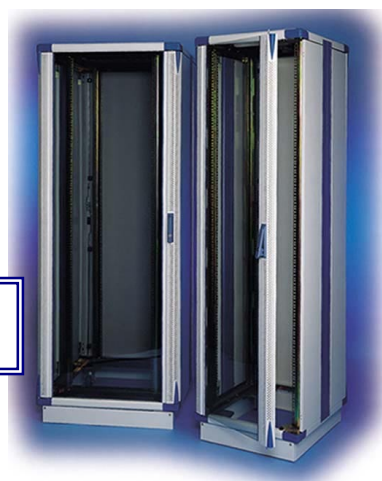
View Of 42U x 800 Wide x 875 Deep Racks with Plinths