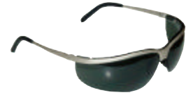
METALIKS Sport with gray lens.