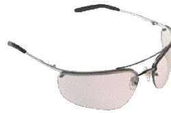
METALIKS with Indoor/Outdoor mirror lens.