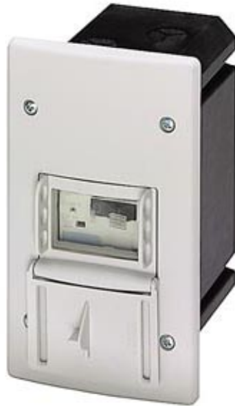
MOULDED-PLASTIC ENCLOSURE FOR FLUSH MOUNTING WITH ACTUATING MEMBRANE