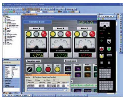
User friendly GT Designer HMI software