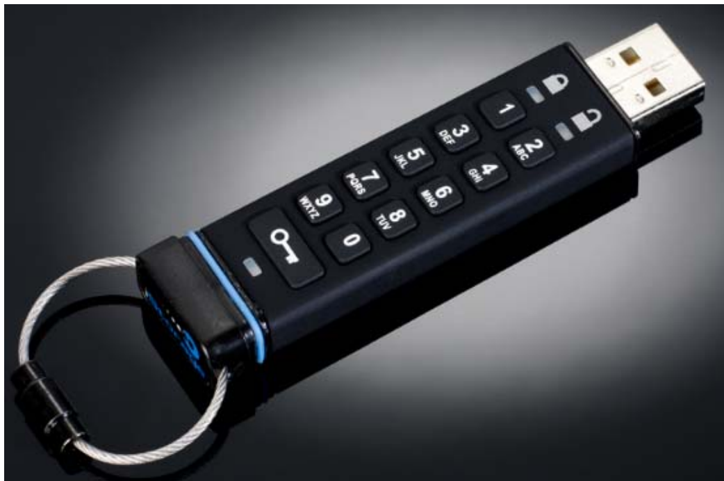
Figure 1 – iStorage datAshur cryptographic boundary showing input buttons and status LEDs

DATASHUR SECURE FLASH DRIVE FIPS 140-2 LEVEL 3 SECURITY POLICY VERSION 7