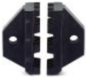
Spare die for CRIMPFOX 25R

Replacement die - CRIMPFOX 25R/DIE - 1212040