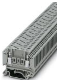
Thermoelectric voltage terminal block, cross section: 0.2 - 2.5 mm 2 , width: 10.4 mm, color: gray

Please be informed that the data shown in this PDF Document is generated from our Online Catalog. Please find the complete data in the user's documentation. Our General Terms of Use for Downloads are valid ( http://download.phoenixcontact.com )