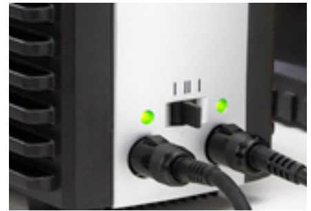
Three position switch. Select left, right or center (both ports operational) to power hand-pieces

To view the complete range of cartridges and tips please visit www.okinternational.com