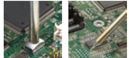
The Cartridge hand-piece uses small diameter cartridges for easy access and includes a full range for SMD rework.