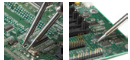
Precision Tweezers rework SMD components with fine dimension to large blade geometries, while the Soldering Tip hand-piece has exceptional power for production soldering.