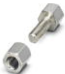
Mounting set, for DSUB gender changer contact inserts