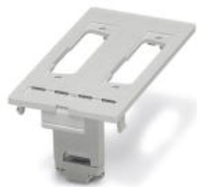
Data front plate, plastic, for 2x D-SUB 25, item 1656961 may be required for mounting D-SUB inserts

Please be informed that the data shown in this PDF Document is generated from our Online Catalog. Please find the complete data in the user's documentation. Our General Terms of Use for Downloads are valid ( http://phoenixcontact.com/download )