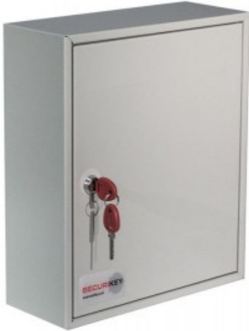
System 24 Padlock