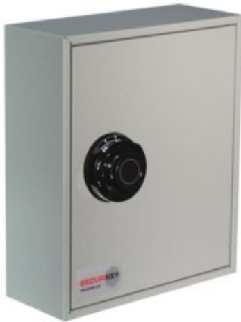
System 24 Padlock Dial Combination Lock