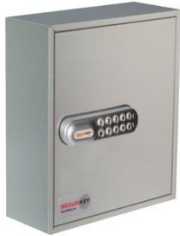
System 24 Padlock CL1000 Electronic Cam Lock