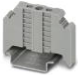
End clamp, width: 9.5 mm, color: gray