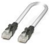
Patch cable, CAT5, assembled, 5 m

Patch cable - FL CAT5 PATCH 5,0 - 2832580